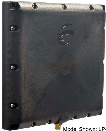
Model Shown: LP-2400-6000-EG