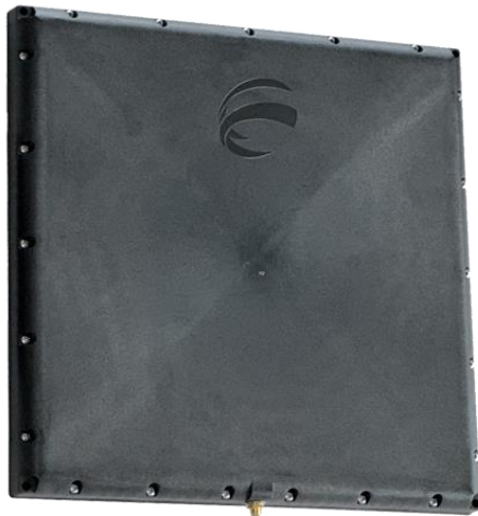
Model Shown: LP-600-4200-EG