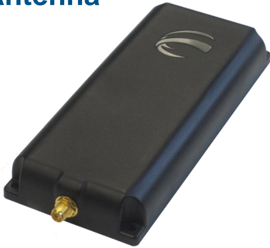
Model Shown: LP-600-4200-LBO