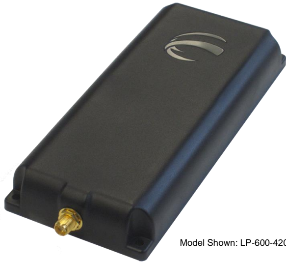
Model Shown: LP-600-4200