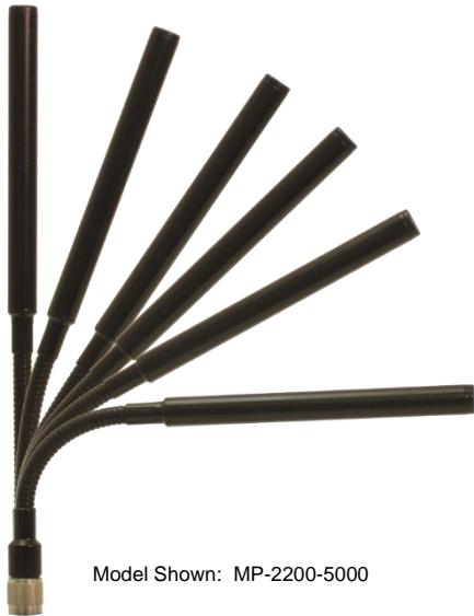
Model Shown: MP-2200-5000