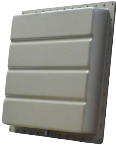
Model Shown: VM-200-6000