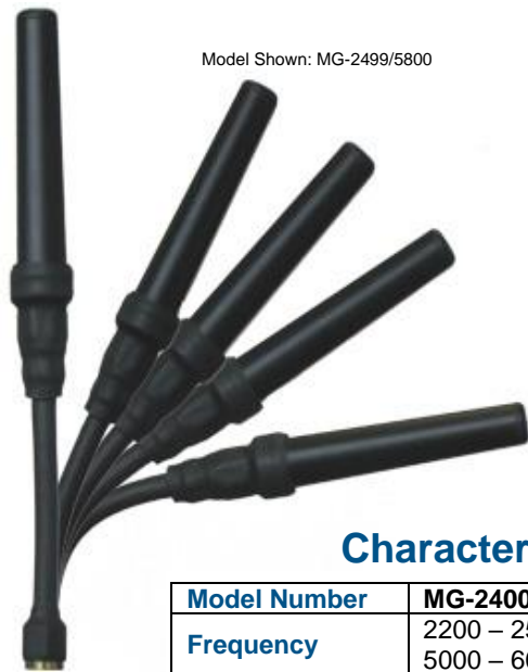
Model Shown: MG-2499/5800