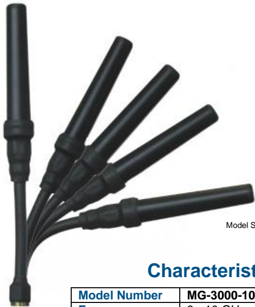
Model Shown: MG-3000-10000