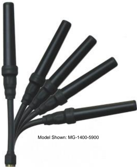
Model Shown: MG-1400-5900