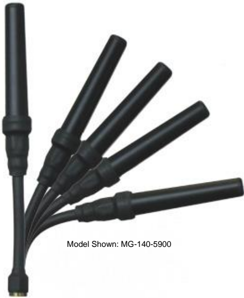
Model Shown: MG-140-5900