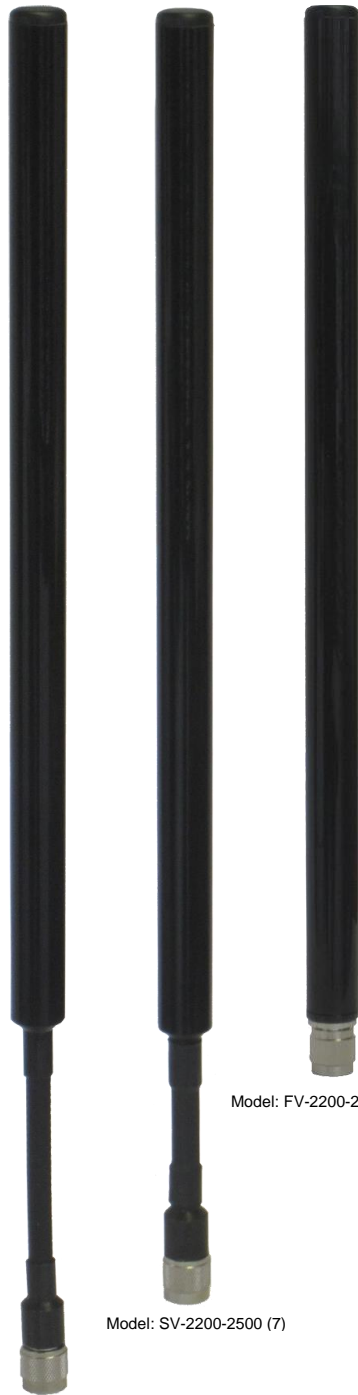
Model: GV-2200-2500 (7)