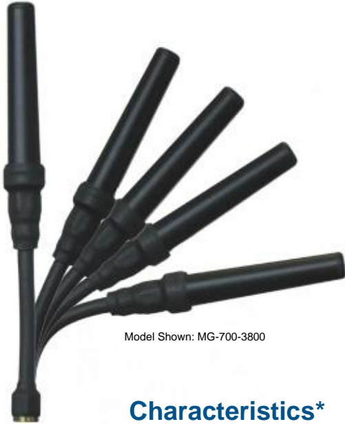
Model Shown: MG-700-3800