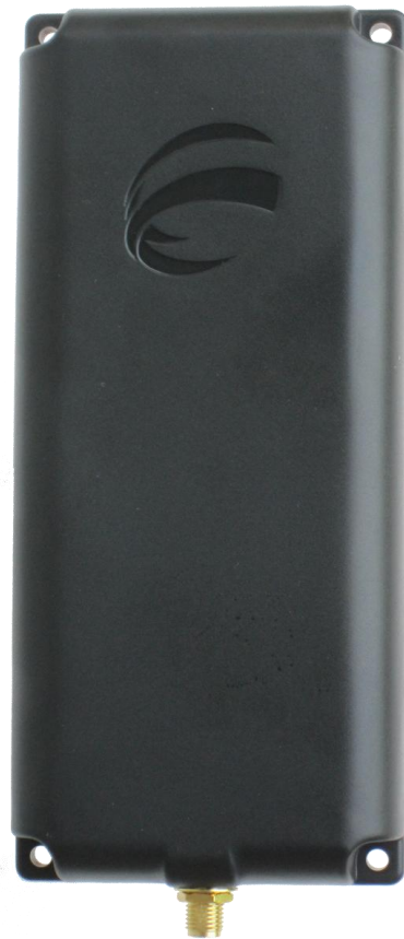
Model Shown: LP-700-3000