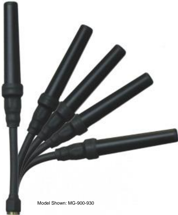
Model Shown: MG-900-930