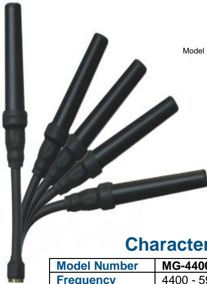
Model Sown: MG-4400-5900