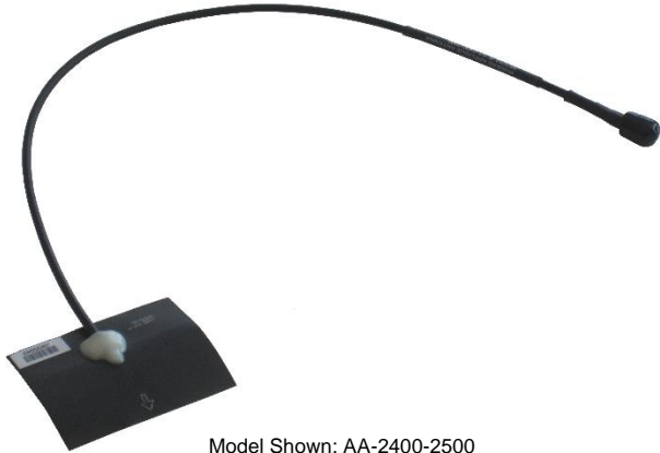
Model Shown: AA-2400-2500