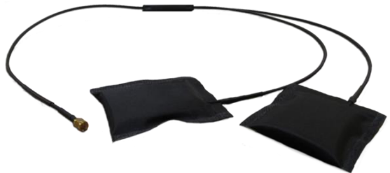
Model Shown: BW-1228/1575-D