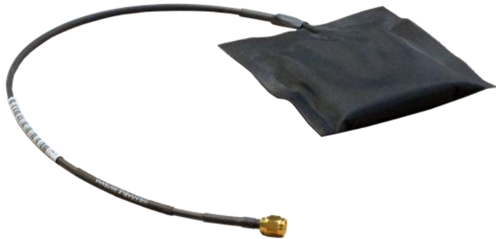
Model Shown: BW-1228/1575