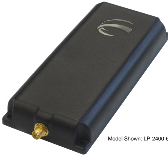
Model Shown: LP-2400-6000