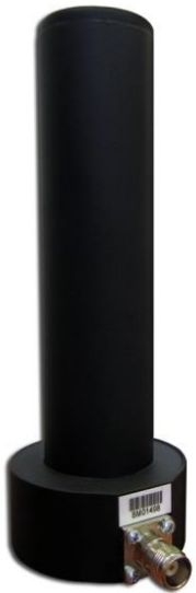
Model Shown: VM-800-3000-M