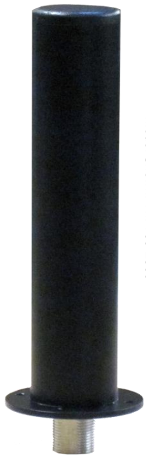
Model Shown: VM-700-2600