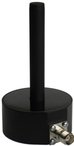
Model Shown: VM-1600-5900-M