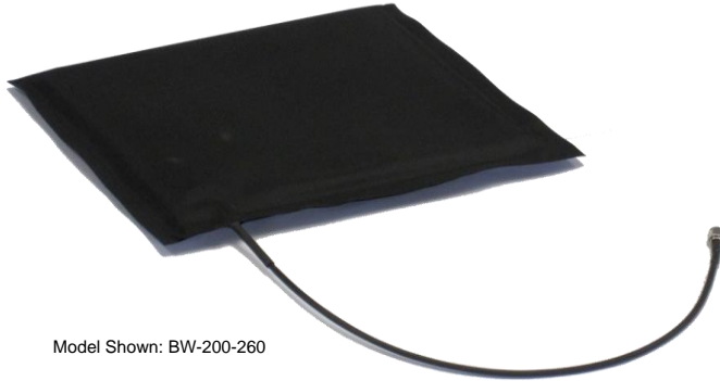
Model Shown: BW-200-260