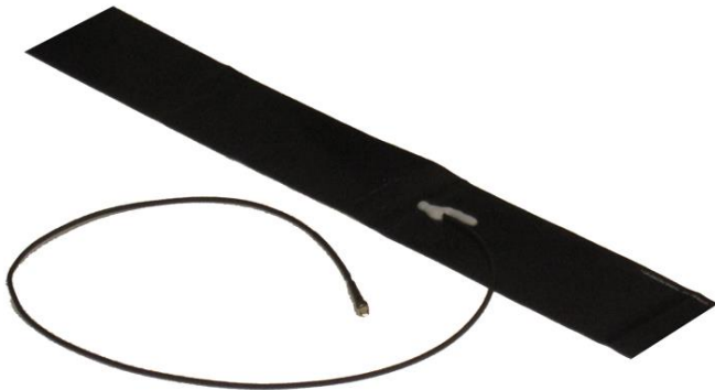
Model Shown: AA-225-512