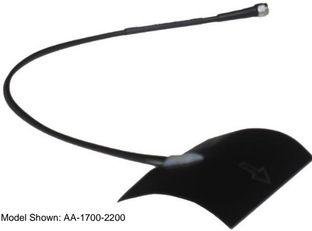
Model Shown: AA-1700-2200