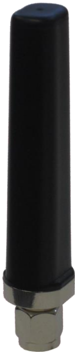
Model Shown: SA-1700-1900