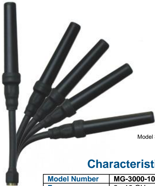
Model Shown: MG-3000-10000