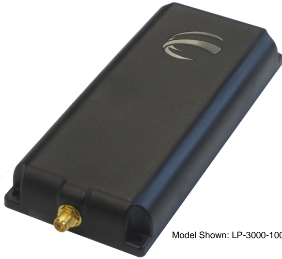
Model Shown: LP-3000-10000