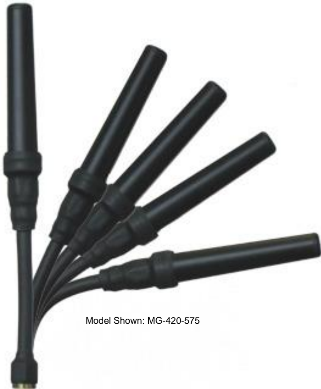
Model Shown: MG-420-575