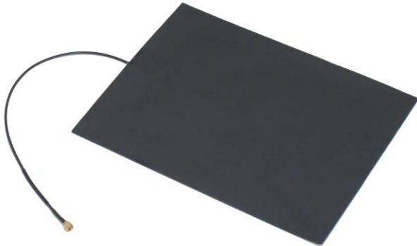
Model Shown: AA-225-6000