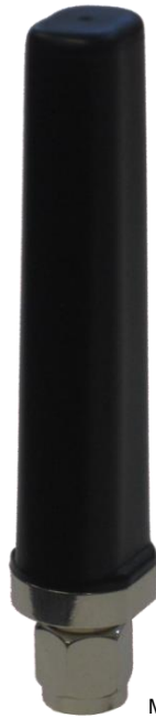
Model Shown: SA-1400-5900