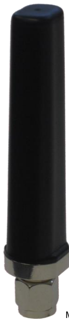
Model Shown: SA-1400-5900