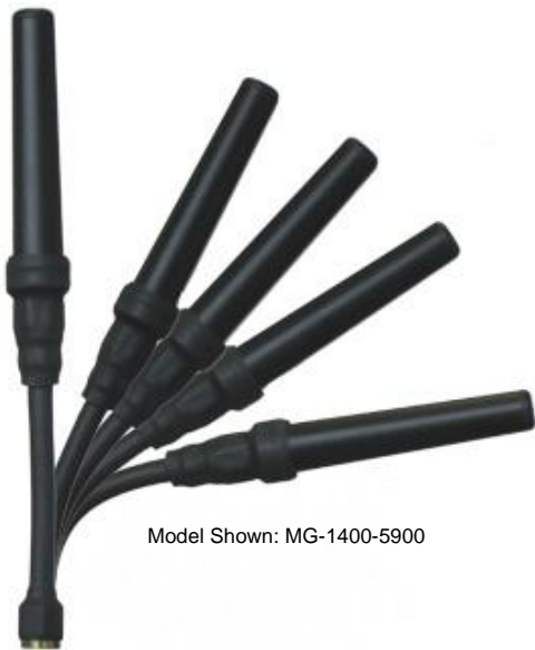
Model Shown: MG-1400-5900