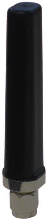
Model Shown: SA-2200-4900