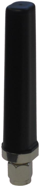
Model Shown: SA-2200-4900