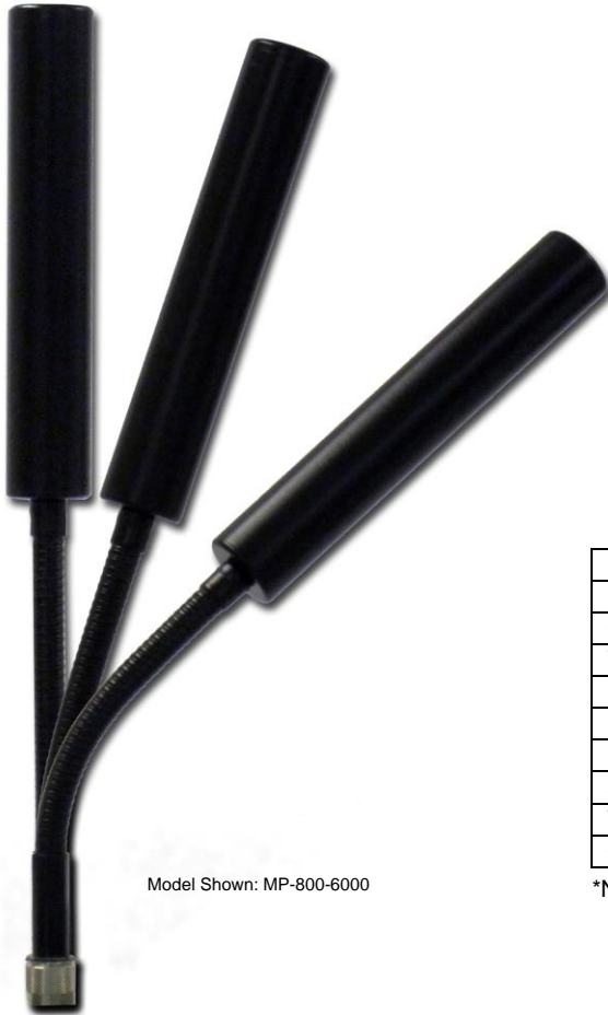
Model Shown: MP-800-6000