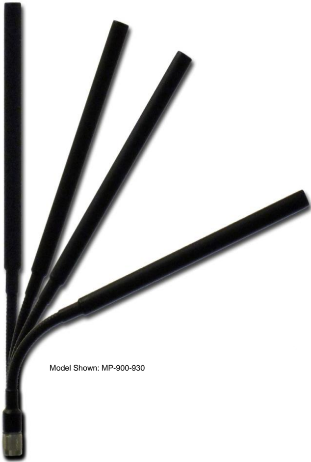
Model Shown: MP-900-930