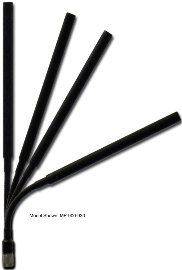
Model Shown: MP-900-930