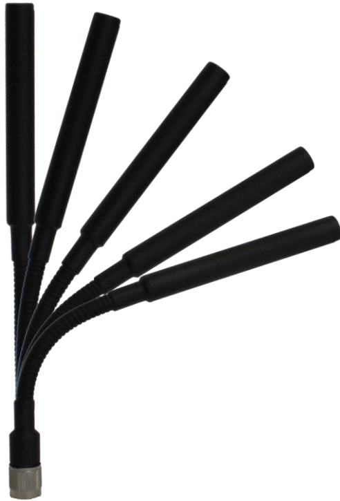
Model Shown: MP-1600-5900