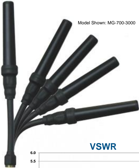
Model Shown: MG-700-3000