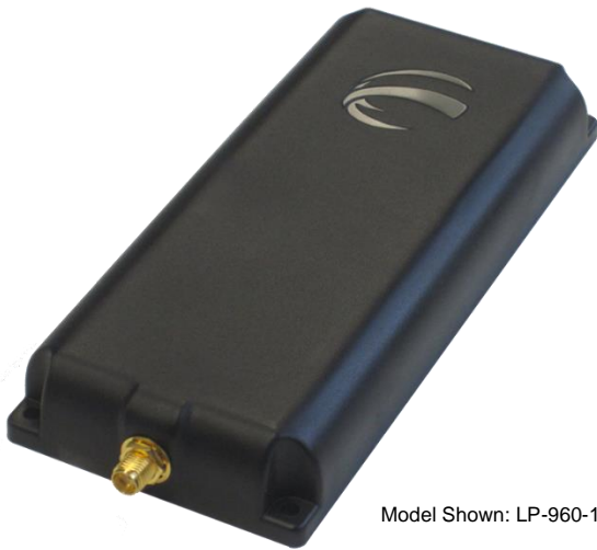
Model Shown: LP-960-1210