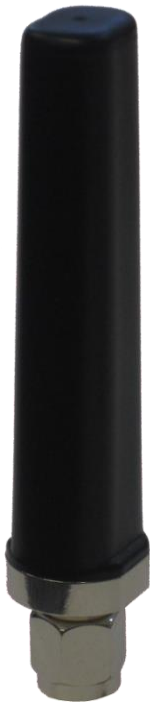
Model Shown: SA-1755-2270