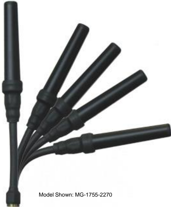
Model Shown: MG-1755-2270