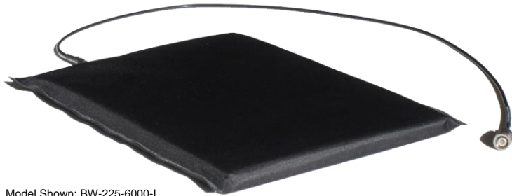
Model Shown: BW-225-6000-I