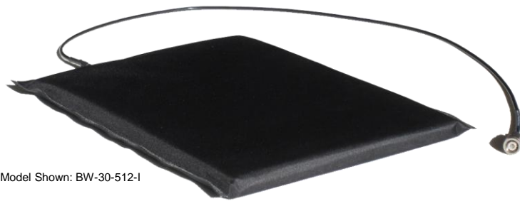
Model Shown: BW-30-512-I