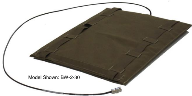
Model Shown: BW-2-30