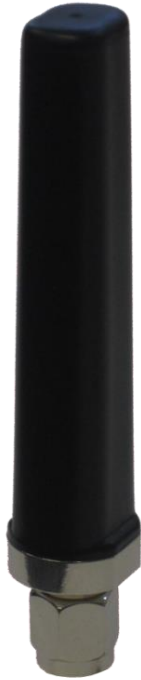
Model Shown: SA-800-2700