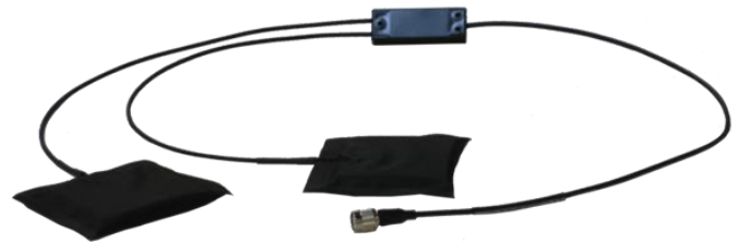
Model Shown: BW-420-450-D