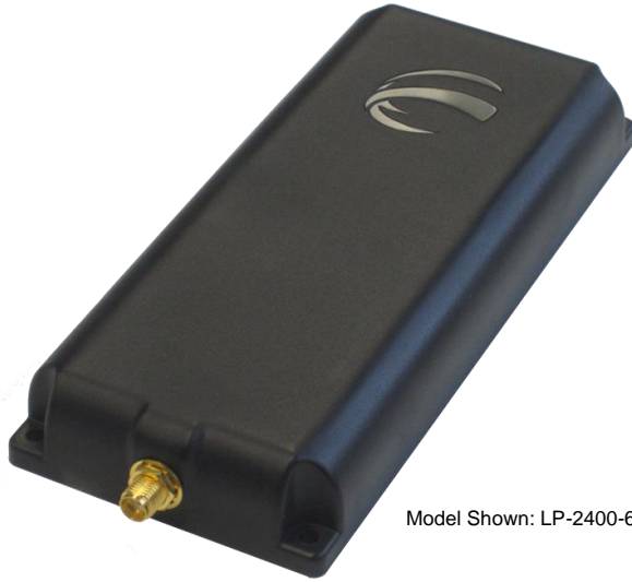
Model Shown: LP-2400-6000