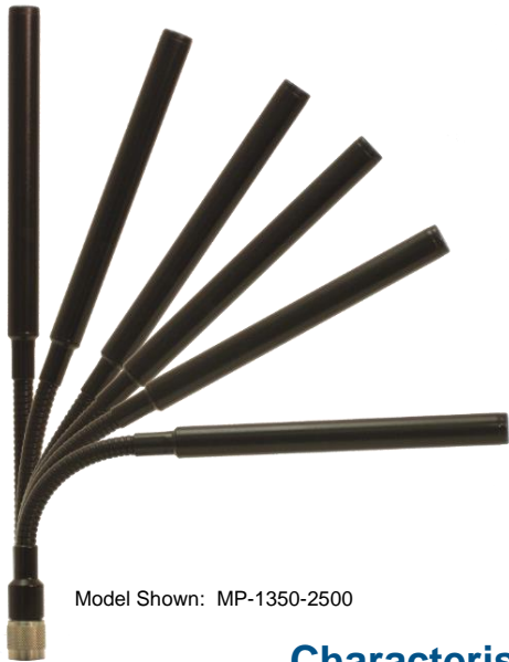
Model Shown: MP-1350-2500