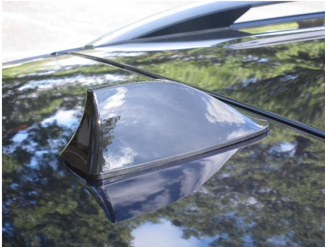
Model Shown: VMSF-136-174